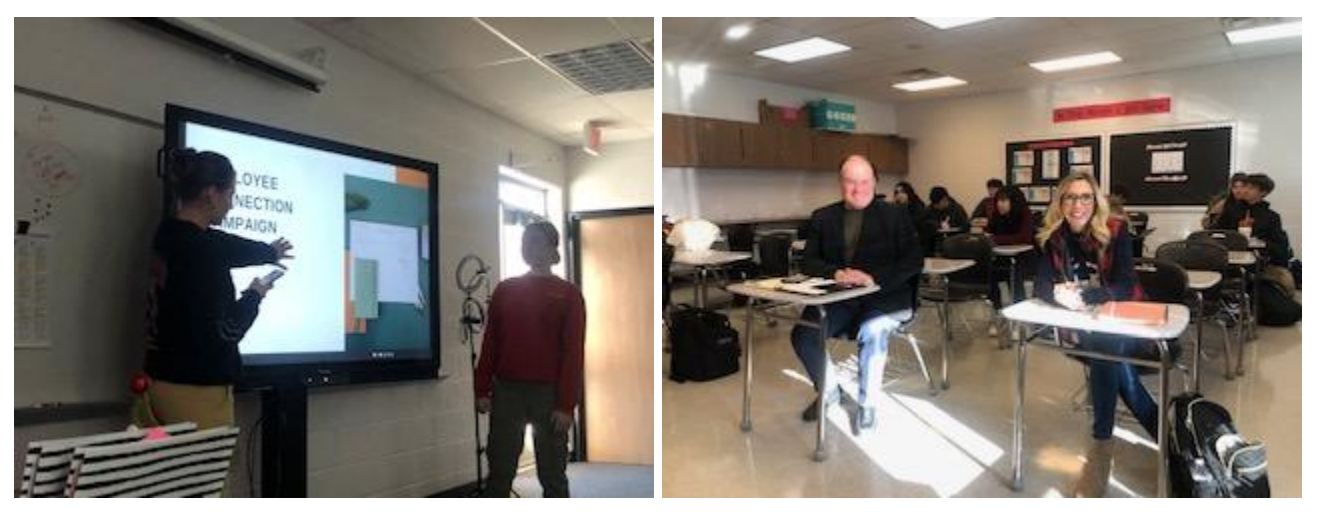
Thank you to BAC members such as Logically IT an HC Companies who go out into the schools and provide Corporate Challenge experiences to our students.

Mentorship programs in place at Painesville Schools for example provide onsite mentoring and job interviewing practice. BAC business members have also conducted Corporate Challenges at schools such as Painesville (Cardinal, Chardon, and Madison are a few other examples) so that students can engage in real-world business problem solving by working in teams and then presenting solutions to business leaders who come to their classrooms.